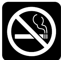
EXHIBIT 8-1: SMOKE-FREE POLICY